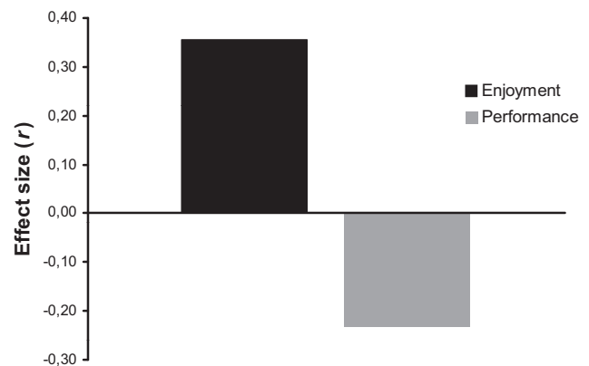
Figure 2. Creative performance as a function of task frame for the positive-negative contrast.

the overall effects of the three contrasts (see Table 3, 4, and 5). This method offers a simple rank-based data augmentation technique and is used to estimate the number of missing studies that might exist in the meta-analysis. The method adjusts for the influence that these missing studies might have had on the estimates of the overall effect